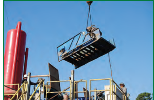
Remove basket and pivot frame.