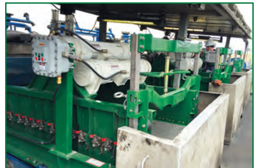
The conversion is complete.