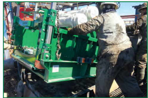
Install Hyperpool Conversion Kit.