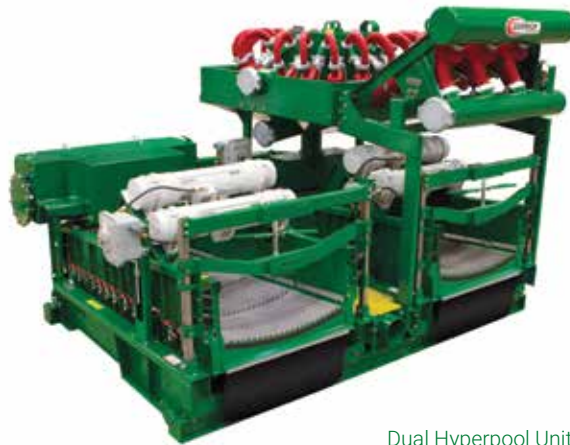
Dual Hyperpool Unit