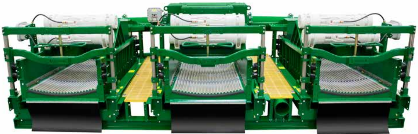
Triple Hyperpool Unit with Integrated Flo-Divider