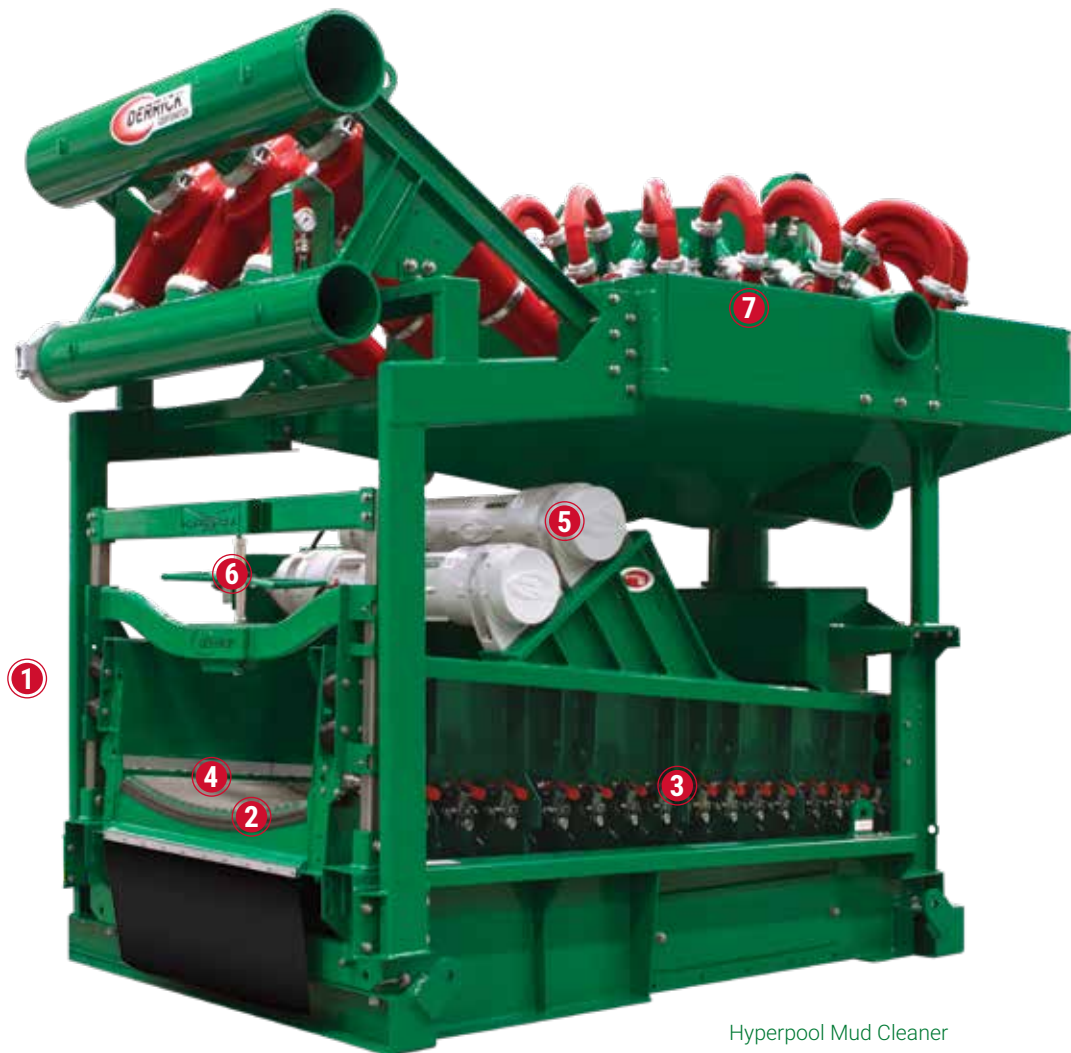
Hyperpool Mud Cleaner