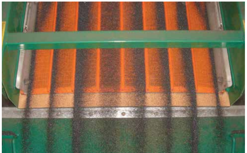
Derrick Dry Screening Machine running fine fractions of foundry sand with Polyweb urethane screens

Extensive sizing test work was conducted on samples produced from the prior unit operations, in pilot plants and laboratories, mostly in Australia.