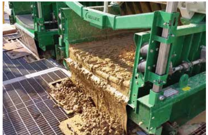
Derrick Hyperpool operating in Sindh province

Derrick's Hyperpool technology was successfully implemented by the customer. The performance provided by Derrick's solids control equipment surpassed the client's expectation by providing an overall mud costs savings of 12%. This reduction in mud cost was attributed to the ability of Derrick's Hyperpool to increase solids removal efficiency. With its increased API RP 13C non-blanked open area screen surface, industry-leading processing capacity, solids bypass prevention, and low maintenance cost, the Hyperpool is well suited for all drilling applications where drilling performance and rig modularity are required. The Hyperpool is designed to bring maximum value to the customer.