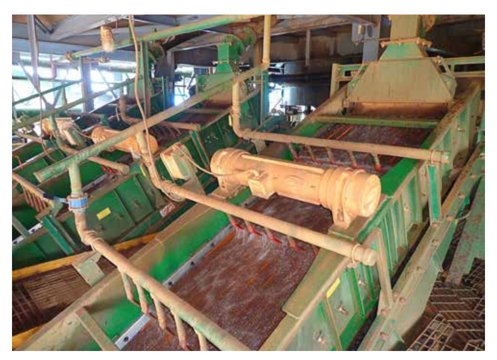
Derrick equipment is lighter and smaller than previously used conventional screening machines

A mineral sand producer in India was using conventional vibrating screen machines in a 0.30mm screening application to produce two garnetrich intermediate products in two sizes. Subsequent stages required high screening efficiency in the wet circuit to recover final garnet and other high-value products. Avoiding misplacement of size fractions, especially garnet, was mandatory. The producer attempted to achieve these results using conventional vibrating screen machines, but a significant quantity of misplacement continued to occur. Consequently, the feed remained constant in the subsequent stage, and production of marketable garnet was low.